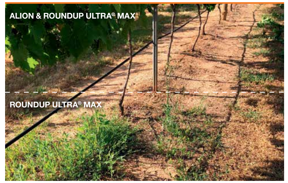
85 days after application