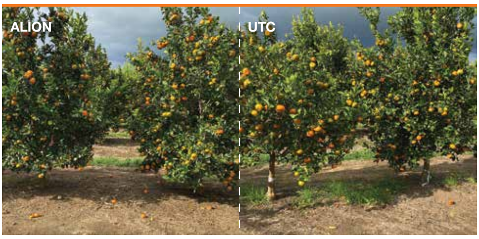
63 days after application