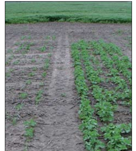
The benefits of blackleg control from Jockey (right) is clearly evident compared to untreated canola (left).