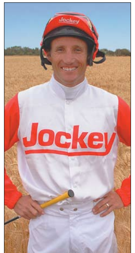
Champion jockey Damien Oliver has reinforced the Bayer CropScience Jockey brand with it's 3 litre and barley claims.

Data protection law provides for common law remedies if agronomists, consultants, other registrants or distributors make off-label recommendations involving protected data.