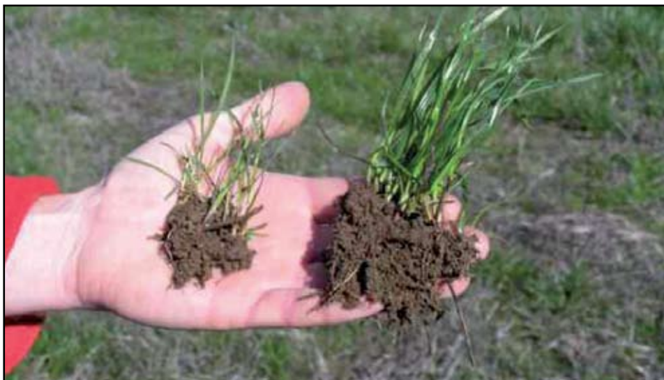
Improved plant growth with the Gauche treated ryegrass compared to the untreated. High populations of RLEM, blue oat mite and lucerne flea were evident on the existing clover in the pasture.

Many farmers have already adopted Gauche® Insecticidal Seed Treatment for their clovers, lucernes and herbs. Farmers can also utilise the benefits of Gauche in their pasture grasses, including ryegrass and fescue.