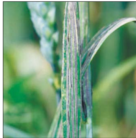
Flag smut in wheat

Wheat, barley and oats are all susceptible to various smut diseases, and each is affected by distinct species specific to each crop. These include covered smut (bunt), loose smut and flag smut in wheat, covered smut and loose smut in barley and covered smut and loose smut in oats. In general, infection is not noticed until ear or head