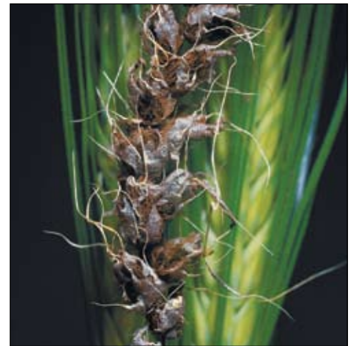
Loose smut in wheat

emergence, when dark or black spores are seen to have replaced grain. These spores are then released at harvest, infecting and damaging the rest of the crop.