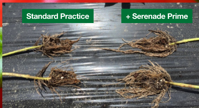
Capsicum root growth at 3 weeks after planting, Stanthorpe 2016

Apply at a rate of 5-7 L/ha through the water wheel or drip irrigation. If using drip irrigation, inject the product towards the end of the cycle to ensure its proximity to the roots. It can be mixed with common fertilisers and pesticides.