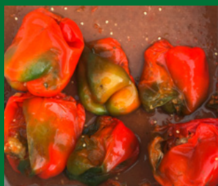
No compost No cover crop

Jurgens Produce, Bowen Qld improved the shelf life of Cayman variety capsicums at 7 days after harvest when used in a program with compost and cover crops. There were improvements to both leaf and fruit micronutrients, especially boron, zinc, manganese and silicon.