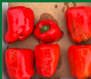
Compost Cover crop