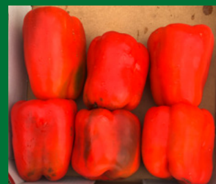
Compost Cover crop + Serenade Prime