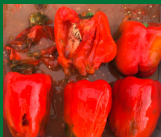
Compost No cover crop